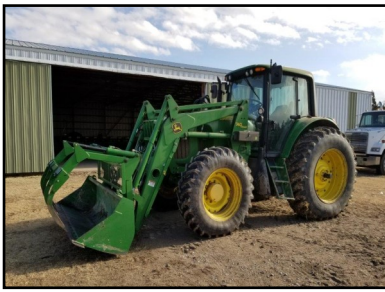
2007 JD 7220 MFWD Tractor w/JD 740 Classic Loader w/Grapple & Joy Stick 10,052 Hours, Power Quad w/ Reverser IVT 3 Hydraulics, 540/1000 PTO, 3 Point w/Quick Hitch

To Register to Bid Online Go To: www.oldwestrealtyandauction.com