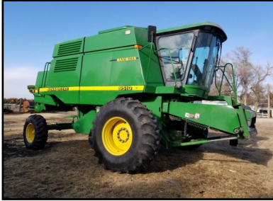
1999 JD 9510 Combine 3,757 Hours, 2,874 Separator Hours Fold Down Extensions

2000 & 1000 Gallon Fuel Tank w/Electric Pumps 500 Gallon Fuel Tank on Trailer Aluminum Four Wheeler Ramps Coleman Powermate Contractor 5000 Generator Acetylene Torch Set Promark Tool Chest Craftsman 2Hp, 26 Gallon. 150 PSI Air Compressor Craftsman Portable Air Compressor Forney 235 Amp Arc Welder Earthquake E43 Post Hole Digger Antique Drill Press NAPA 85-1010 Battery Charger & Starter Stihl MS 270C Chainsaw & Case Dayton 3/4 Hsp, 1 Phase, Bench Grinder Large Anvil Welding Table Bench Vises Several Bolt Bins Lots of Bolts, Nuts & Screws Shovels Pitchforks Post Hole Diggers Cob forks Ice Breakers Axes Post Hole Drivers Fence Stretchers Fence Supplies Several Log Chains Tractor Chains Vise Grips Crescents Hammers Drills C-Clamps Lots of Electric Hand Tools Come a Longs Hydraulic Jacks Floor Jacks Handyman Jacks Several Standard & Metric Wrenches Screwdrivers Several Socket Sets from 1/4" to 3/4" Impact Sockets Punches Bolt Cutters Pliers Hitch Pins Clevis's Saws Levels Wrecking Bars 100' 220 Extension Cord Lots of Extension Cords Saddle King 15" Saddle Misc. Old Saddles Misc. Tack Saddle Blankets Calf Puller Hydraulic Cylinders Battery Operated Grease Guns Electric & Solar Fencers Spotlights Funnels, Oil & Miscellaneous Craftsman 625 Walking Weed Wacker Lots of Irrigation Socks Aeration Tubes & Fans Misc. Tires & Rims